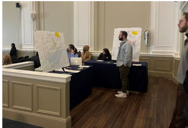
NYU Project Team gathering insights on where flooding impacts the Town most.

Transportation, sustainability, and public services were key themes. Transportation challenges include high car dependency, limited public transit access, and increased traffic and crashes, with ongoing projects like the Oakdale Merge and Complete Streets Policy. Sustainability efforts focused on protecting Islip's natural resources, mitigating flooding risks, and enhancing resilience through initiatives like tree planting and ecological restoration projects. Public services showcased the Town's extensive park network, including recent upgrades, and strong community resources like libraries, schools, and healthcare facilities, anchored by major hospitals undergoing significant expansions.